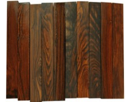
Cocobolo King Pen Blanks