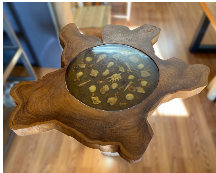
Strangler Fig Base with Tempered Glass Top