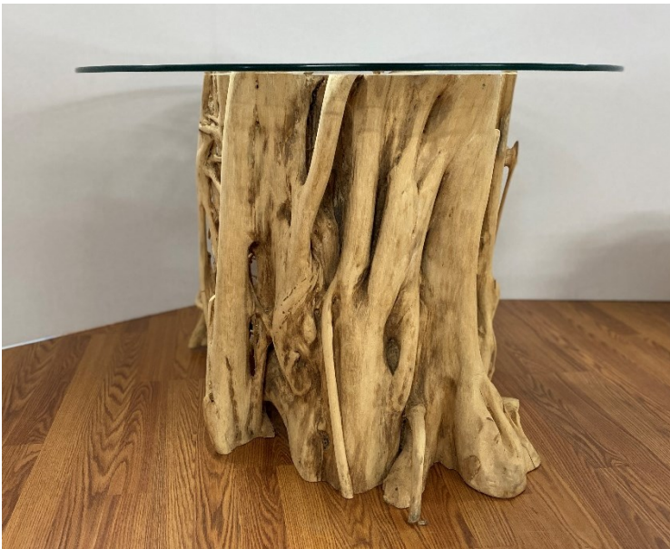
Strangler Fig Base with Tempered Glass Top