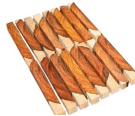
Pen blanks with some white wood

* Larger dimensions available. Other lengths available in 1.5" x 1.5", and 2" x 2" * Quarter sawn and Bookmatched stock, logs and bowl blanks available. Please inquire.