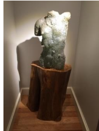
Teak bases work great for stools, coffee tables or dining table bases