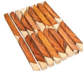
Pen blanks with some white wood

* Larger dimensions available. Other lengths available in 1.5" x 1.5", and 2" x 2"