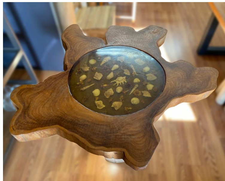
Strangler Fig Base with Tempered Glass Top