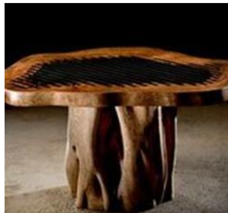
India tree bases come in dining and coffee table heights