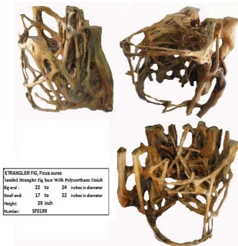
Strangler fig bases come in dining and coffee table heights

Longer, wider, and thicker wood available We custom saw, kiln dry, and finish (plane, sand, T&G, etc.)