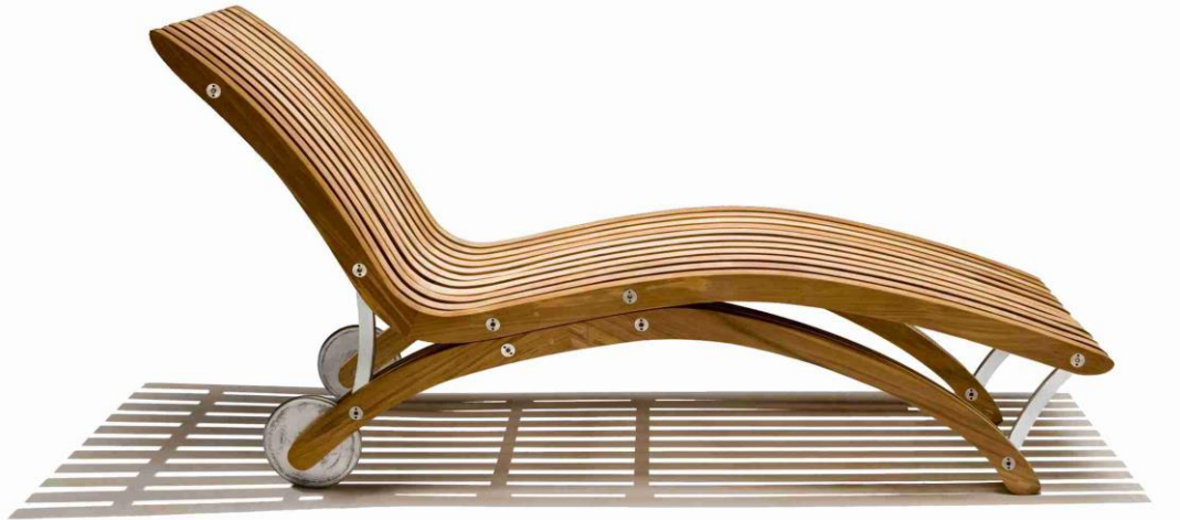
Spirit Song Chaise Lounge