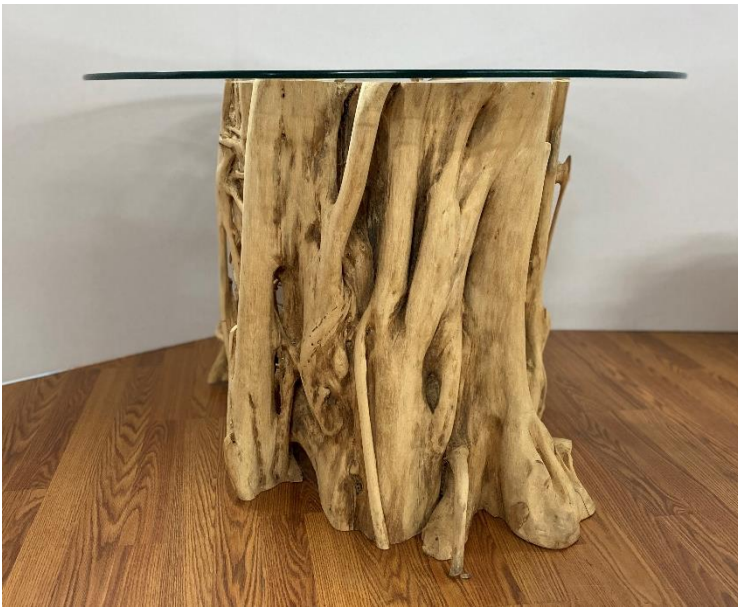
Strangler Fig Base with Tempered Glass Top