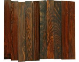
Cocobolo King Pen Blanks